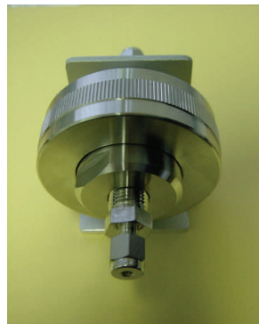
Assembled filter with 1/8" Swagelok fittings

"Stainless steel gas filter with easy-to-change media filters"