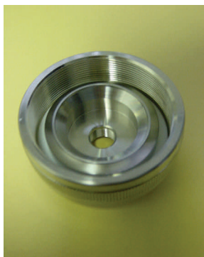
Locking ring and inlet body

"Stainless steel gas filter with easy-to-change media filters"